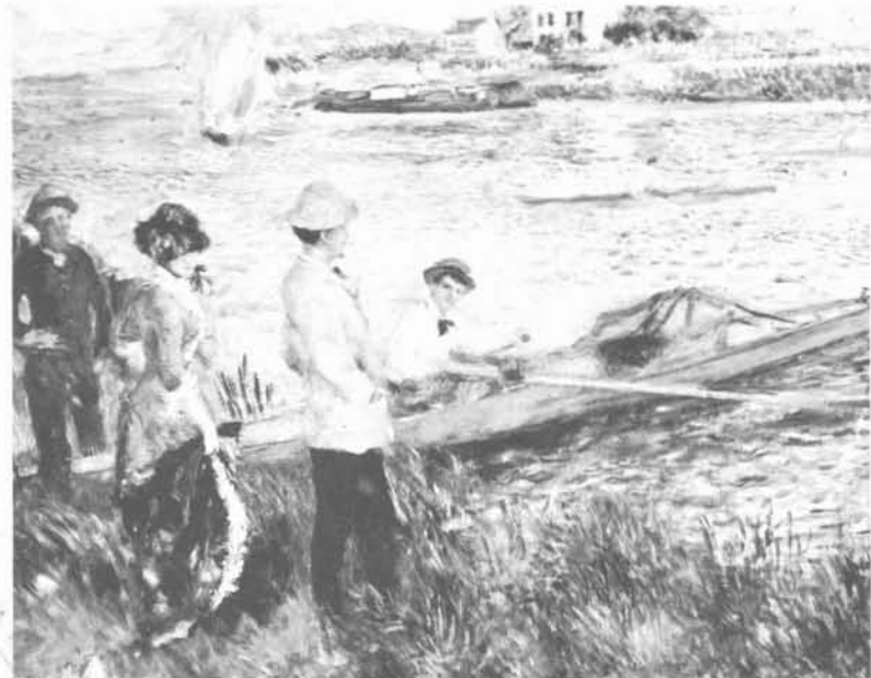
1. OARSMEN AT CHATOU by Pierre Auguste Renoir, National Gallery of Art, Washington, D.C.